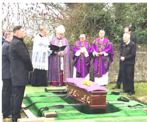
1st Photo from left to right: