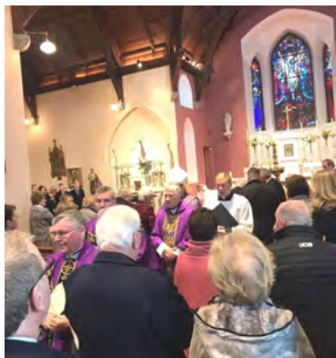
2nd Photo from left to right during the recessional hymn: