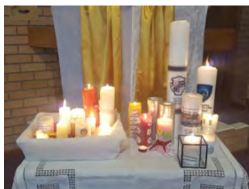
Family Candles that were lit during our Easter Services—you were included in our prayers